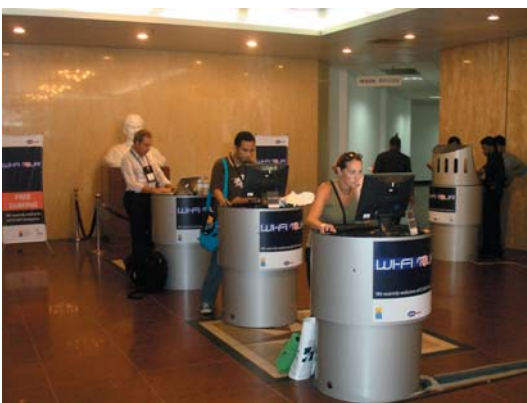
SLT was principal sponsor of the 8th International Congress on AIDS in Asia and the Pacific held in Sri Lanka in August 2007.