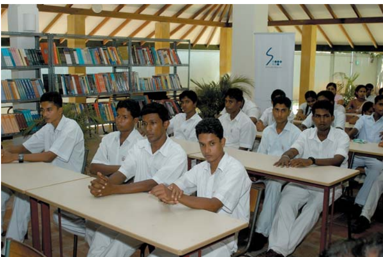
SLT in association with the Asia Foundation distributed 100,000 books around the country. An annual programme since 2003.

SLT has been involved with the Asia Foundation's 'Books for Asia' programme since 2003.