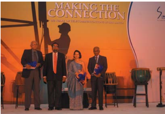
SLT launched a book titled “Making the Connection” to commemorate 150 years of telecommunications in Sri Lanka.

An apt illustration of how all our people get involved is to be found in the initiatives of our Sales Division, which raised a donation for the Cancer Hospital, Maharagama, through personal contribution.