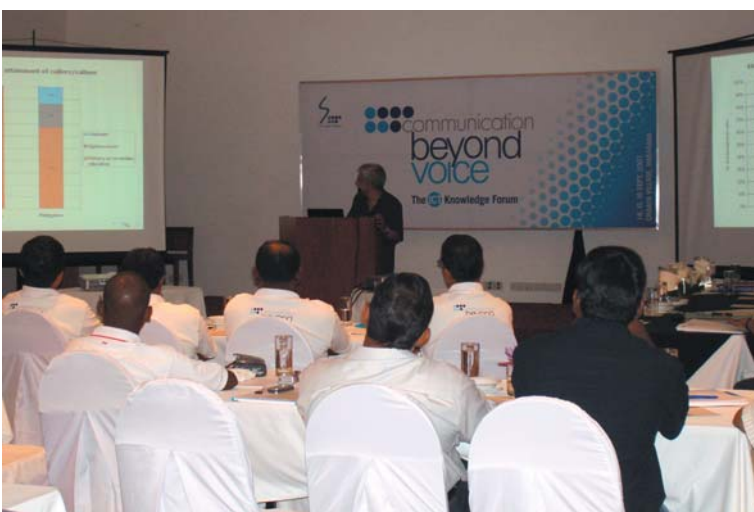
"Communications Beyond Voice" a 3-day event hosted by SLT for media professionals.

This event introduced media professionals to the convergence in technology and the role it plays in keeping us abreast of the rapid, cutting edge change that is taking place in the global telecom field.