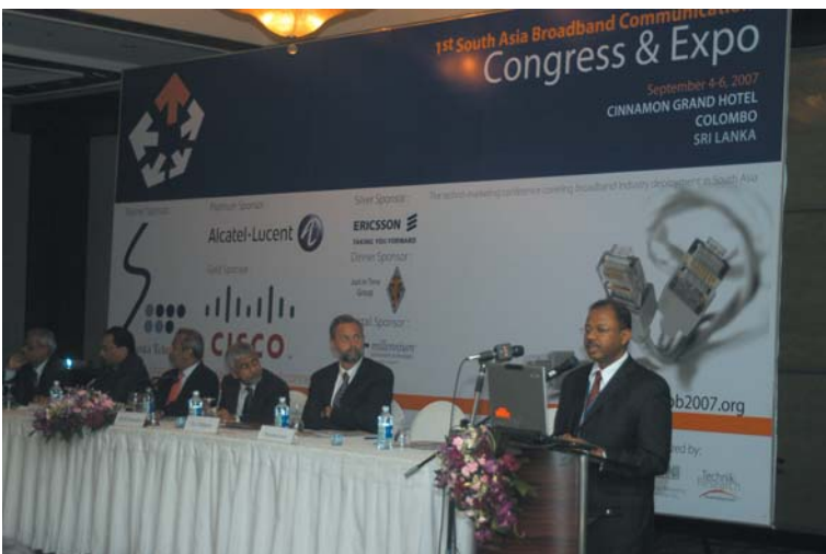
SLT was a partner sponsor of the first ever South Asian Broadband Congress and Expo held in Colombo in 2007.

The main aims of this meet was to provide a forum where telecom operators and Internet service providers could meet and share their experiences whilst also promoting the benefits of Broadband technology to end users.