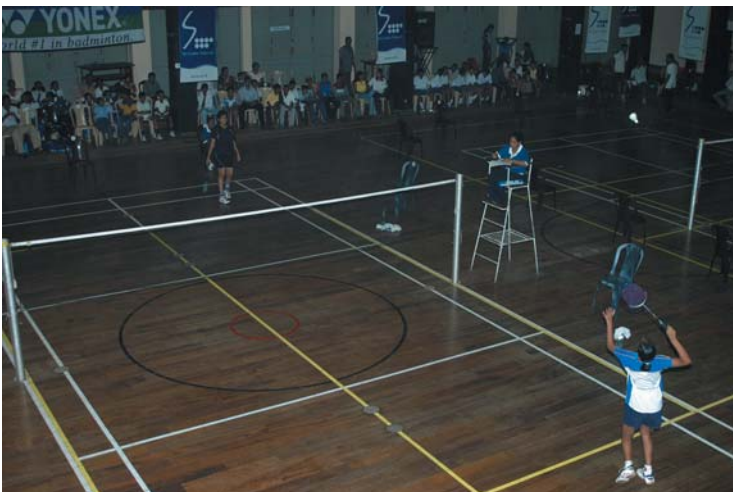
SLT sponsors the Junior National Badminton Championships for the second consecutive year.

SLT has a strong tradition of fostering sports in Sri Lanka, sponsoring the South Asian Games in Colombo last year and the Sri Lankan contingent to the 15th Asian Games in Doha, also last year.