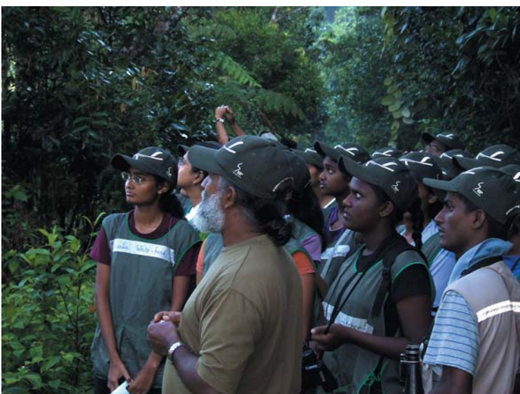
SLT continues to be involved with the field ornithological group of Sri Lanka of the University of Colombo in their efforts to conserve the Sinharaja Forest Reserve.

SLT's aim is to make conservation a habit.