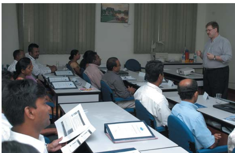
1,026 training programmes covering 174,688 training hours with a participation of 13,396 were conducted in 2007.

Also, programmes were provided to enhance motivation and workplace co-operation amongst employees.