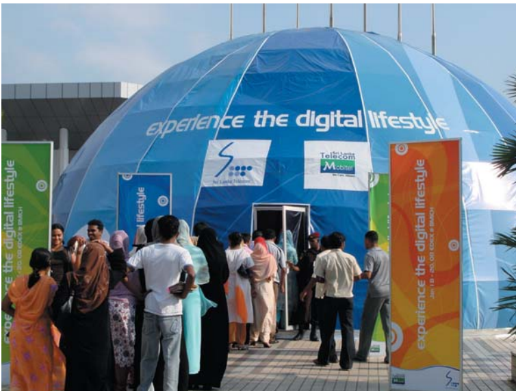
SLT's theme attraction, "experience the digital lifestyle" at EDEX 2008. It was SLT's endeavour to link Sri Lankan youth with choices, options and opportunities in post secondary education, skills development, vocational and technical training leading to gainful employment.

The BMICH, Colombo played host to EDEX 2008 an exhibition that took place in January 2008.