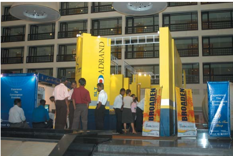
SLT hosted the 9th networking conference of the South Asian Network Operators Group in January 2007.

The first ever South Asian Broadband (SABB) Congress and Expo was held in 2007 in Colombo. SLT was partner sponsor of the event.