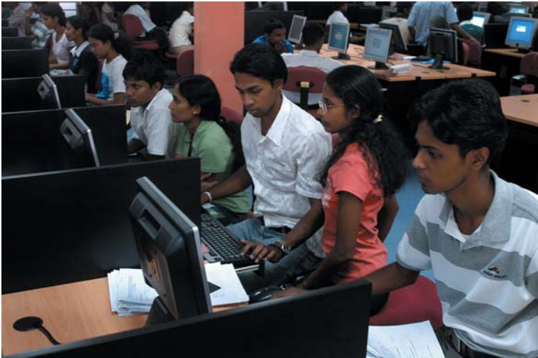
ICoRN Lab - University of Peradeniya - donated by SLT, enables graduates to meet the growing demand of rapid development of technology and industry.

In the year under review, SLT in association with the Asia Foundation distributed over 100,000 books around the country. Beneficiaries were schools, universities, libraries of professional bodies among others. The books were on a wide variety of subjects.